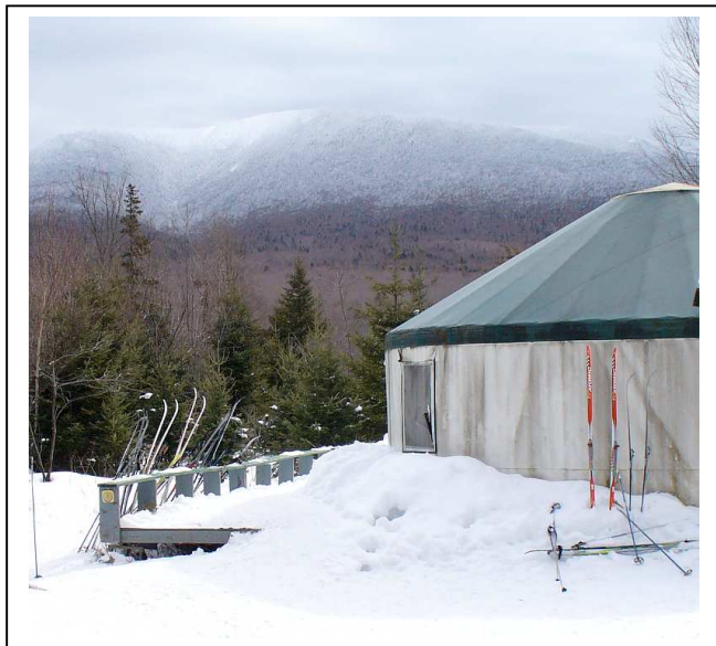
Bretton Woods; outside the hut

March 13-14, 2010 Lapland Lake Mid-Atlantic Bill Koch Festival