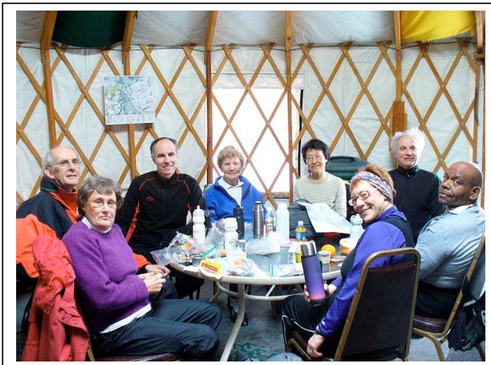
Bretton Woods; inside the hut

Rochester Nordic Ski Club PO Box 22897 Rochester, NY 14692